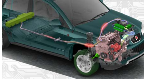
Saturn Vue Green Line hybrid layout

Big trucks (Chevy Tahoe, GMC Yukon and Cadillac Escalade) will be available in 2008 with the Dual-Mode Hybrid from the tripartite development program. It will be mated with GM "Gen IV" small block V-8. GM says this rig will see a 15% improvement in composite fuel economy.