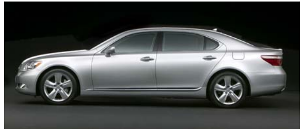
Lexus LS-460. Is that a “Bangle bump?”

Lexus didn't go too deeply into the features portfolio of the LS – which is expected to be rich – but based on our experience in Tokyo recently we expect to see adaptive cruise control and some form of advanced backup and/or parking aid. We don't expect night vision or adaptive headlamps. There will be more on this after the New York Auto Show in April.